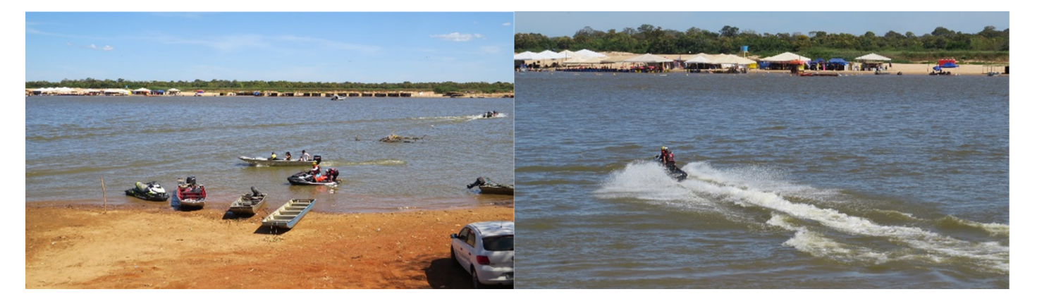
Figure 6. Occupation of Araguaia River and sandbanks in Luiz Alves (13°12'43" S, 50°34'54" W), Goiás, Brazil, from boats, jet skis, and touristic cabanas during the recreational fishing season (May-Sep 2022).