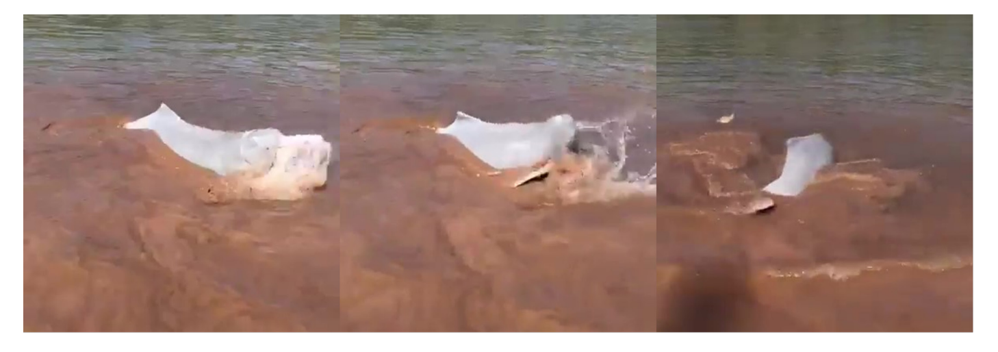
Figure 3. Araguaia River dolphins returning to the riverbed after voluntary beaching behavior to capture their prey in Barra do Garças, Mato Grosso state, Brazil (15°53'37" S, 52°15'17" W) (G1 MT 2019).

conflicts such as collisions (Van Waerebeek et al., 2007; Zappes et al., 2013; Schoeman et al., 2020), mutilations of propellers (Byard et al., 2013), exposition to noise pollution (Weilgart, 2007), interactions with lines and hooks (Gilman et al., 2006), and can lead to reduction in feeding intake rates and affect dolphin population survival (Forney et al., 2017; Tenan et al., 2020).