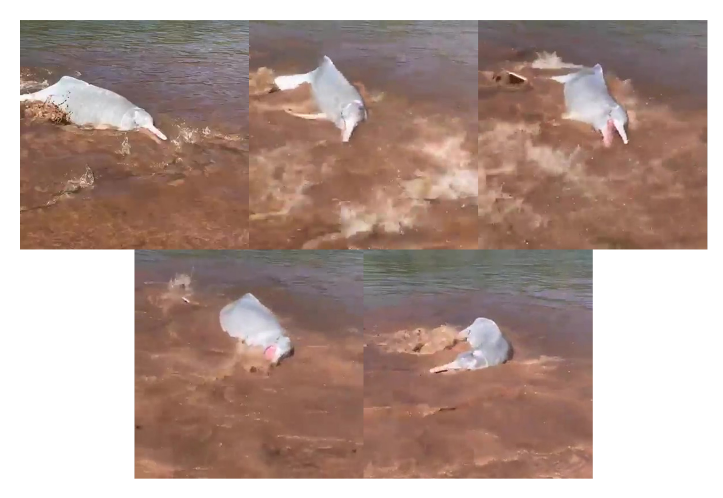
Figure 2. Voluntary beaching behavior of the Araguaia river dolphins to capture their prey in Barra do Garças, Mato Grosso state, Brazil (15°53'37" S, 52°15'17" W) (G1 MT 2019).