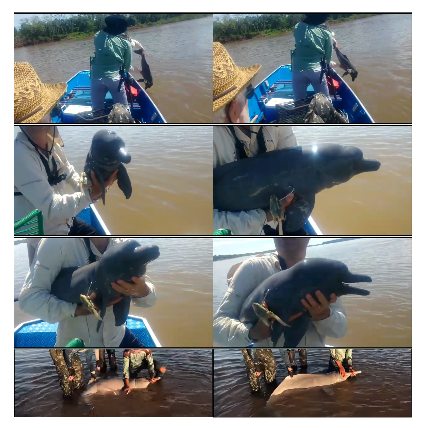
Figure 5. Frames of videos available on Youtube that document a calf and an adult Araguaia River dolphin bycaught on hooks in the Araguaia River, state of Goiás, Brazil, in separated occasions. Links to videos and the faces were omitted to protect user privacy (Di Minin et al., 2021).

deepen the understanding of behavioral aspects and better assess any ongoing conflicts.