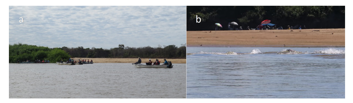
Figure 4. Recreational fishing boats approaching the sandbank where Araguaia River dolphins were foraging (a) and animals left the area. On another occasion, dolphins remained foraging with boats and tourists behind the sandbank (b). Events were recorded in Luiz Alves (13°12′43″ S, 50°34′54″ W) and Bandeirantes (13°41′02.15″ S, 50°48′25″ W), in the state of Goiás, Brazil.

It is important to reinforce that these observations were made by the authors and should not be generalized, as the study area is restricted, and the animals may behave differently in other regions or even in different seasons. In fact, these observations should serve as a guide and a call for further investigations to